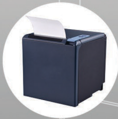
Top Paper Loading