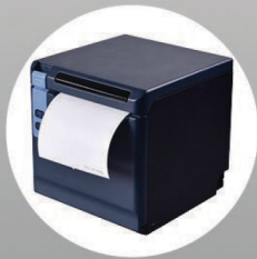
Front Paper Loading